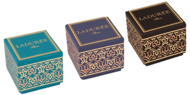
Individual boxes of 2 macarons £6.50