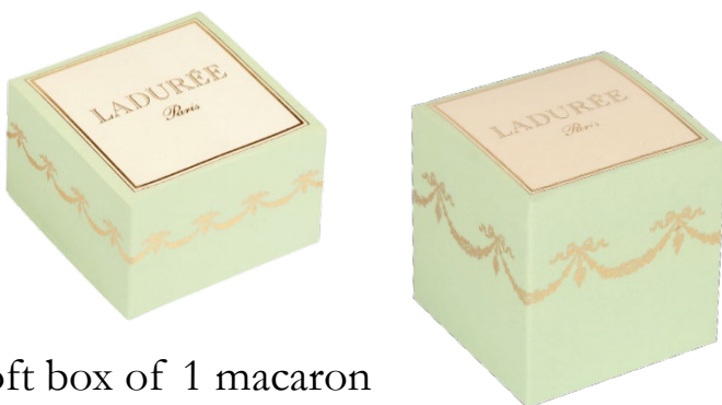
Soft box of 1 macaron £2.50 each