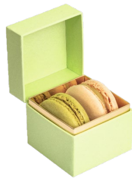
Gift box of 2 Macarons Green £6.30 each