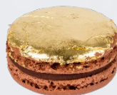
Gold or Silver macaron