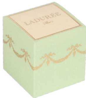
Soft box of 2 macarons £4.80 each