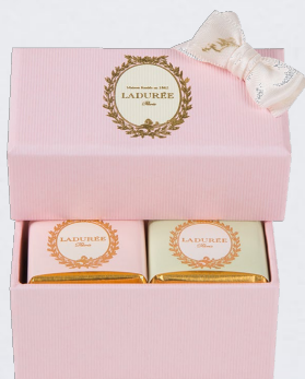
14 Carré Degustation chocolates gift box £7.50 VAT Incl.