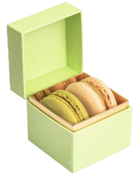
Gift box of 2 Macarons Green £6.30 each