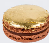
Gold or Silver macaron