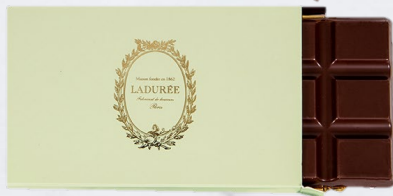
Mini Dark Chocolate Bar 64% cocoa (42 g) £4.10 Incl VAT