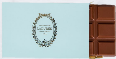
Mini Milk Chocolate Bar (42 g) £4.10 Incl VAT