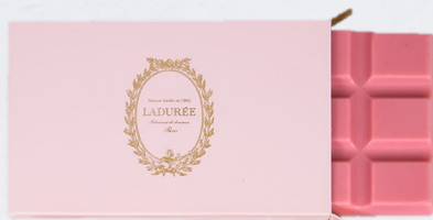
Mini Ivory Chocolate Bar flavoured with rose (42 g) £4.10 Incl VAT