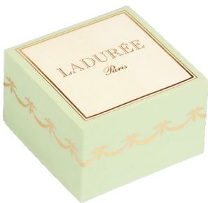
Soft box of 1 macaron £2.50 each