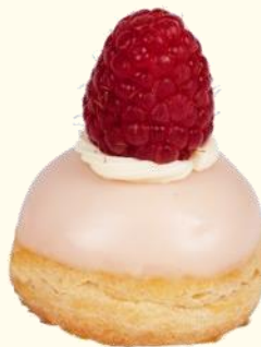
Rose & Raspberry