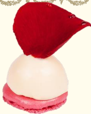
Rose and Raspberry