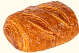
Pistachio & Chocolate Croissant