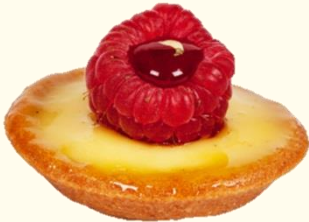
Raspberry Passion Fruit