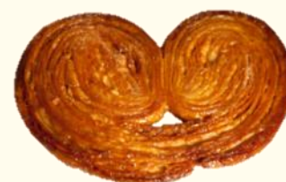
Heart-Shaped Puff Pastry